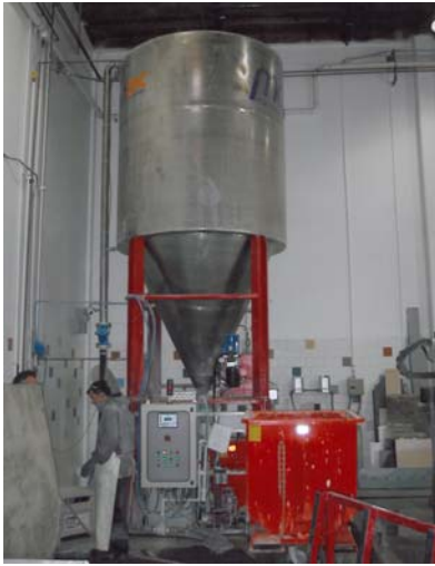
Silo where flocculation and particle separation occur. The red apparatus to the right is the filter press.