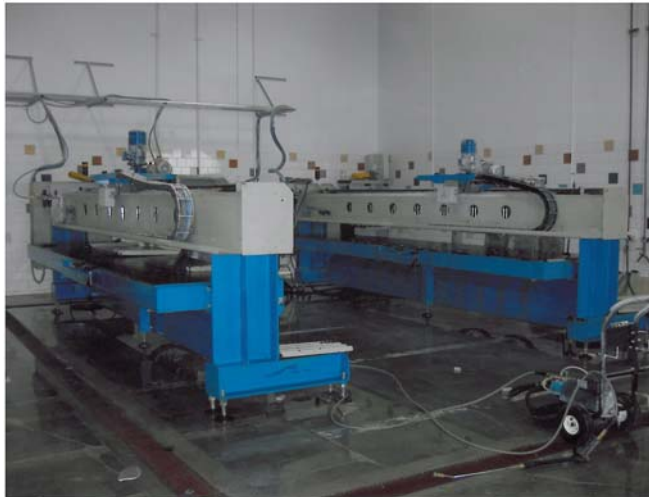
Remediated water is returned to the processing area and reused in such applications as the polishing stage pictured here.

filter press where the water is squeezed out until the particulates become a solid brick. Clean water is piped into the processing facility for reuse, while the bricks are transported back to the local quarry where they are laid as road base.